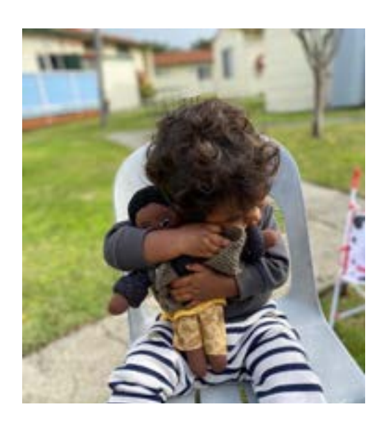
The variety in Uthando Dolls and the photo that tells how special they are!