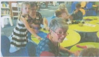
Sorrento Group Library workshop