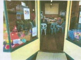
Workshop and display at Albany Museum