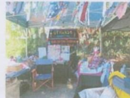
Uthando in the community