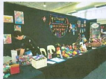
Showing our wares at Claremont Craft Fair