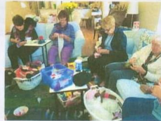
Post-COVID ARCC team get together