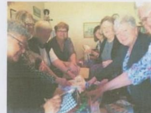
Fremantle Hamilton Hill Group